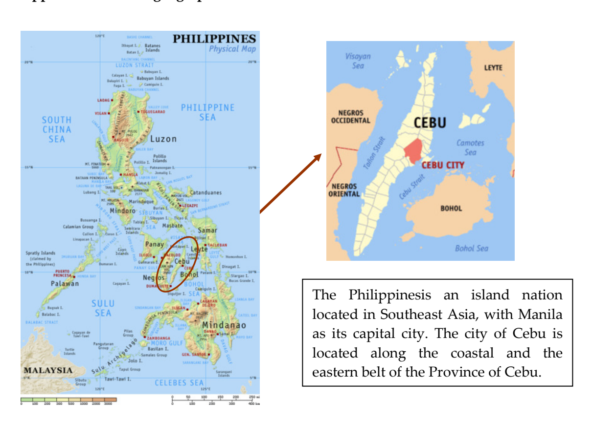
Appendix 2: Cebu's geographic and climatic characteristics

<sup>31</sup> The relationship between maternal education and the behaviors of interest might be confounded since we cannot control for their level of initiative or determination. If a particular characteristic motivates certain women to obtain education and carries over to other aspects of their lives, it may be this level of motivation that affects